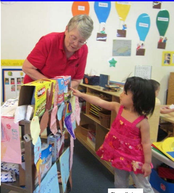
Cheryl's Ice Cream Cart