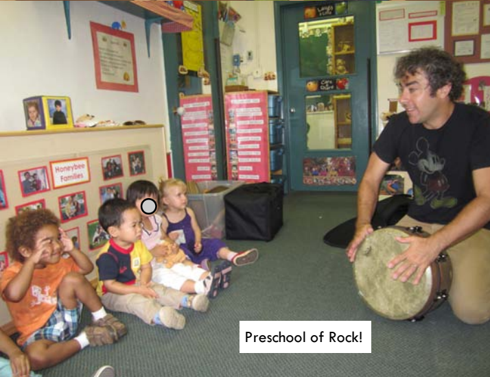
Preschool of Rock!

Summer days are ideal for special events and special visitors.