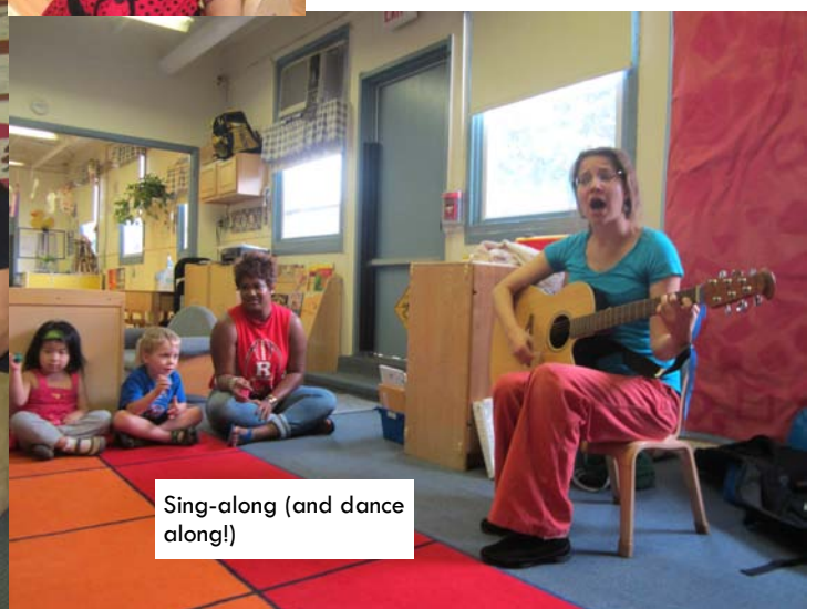
Sing-along (and dance along!)